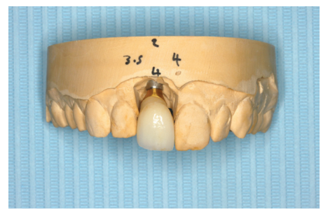
Figure 5: E.max crown on working model