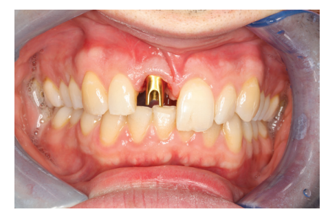
Figure 6: Atlantis Goldhue abutment in situ