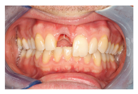
Figure 2: Soft tissue developed using a temporary crown