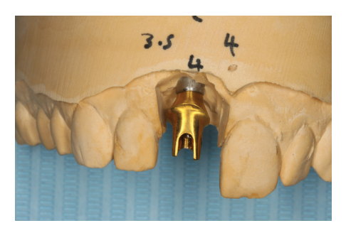
Figure 4: Atlantis Goldhue abutment (Astra Tech)