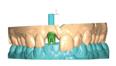
Figures 3a and 3b (above and right): Atlantis virtual abutment design