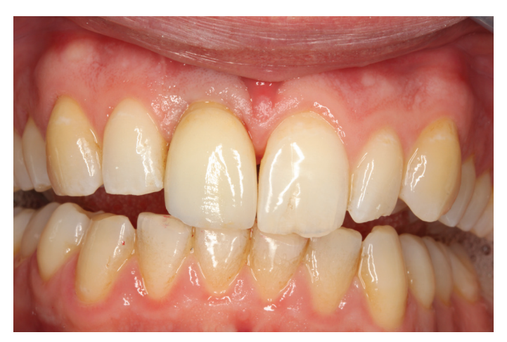
Figure 7: Final presentation